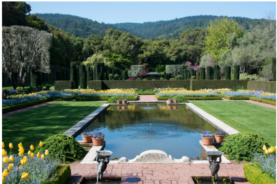
The famed Filoli Country House in Woodside.