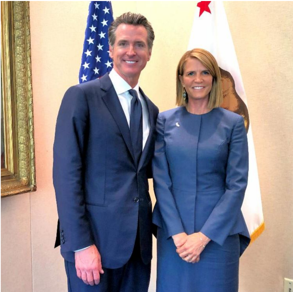
Governor Newsom with new CFC Executive Director Colleen Bell following the swearing-in ceremony

Colleen Bell, former US Ambassador to Hungary and producer at Bell-Phillip Television Productions, was appointed executive director of the California Film Commission by Governor Gavin Newsom on May 23rd. She was administered the oath of office by the Governor on June 18th at the State Capitol.