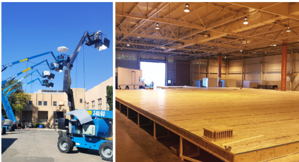
(left) A bevy of boom lifts is part of the equipment readily available on the island. (right) Historic Building 1310 was once used to build warship components, but now houses three sound stages totaling more than 115,000 square feet.