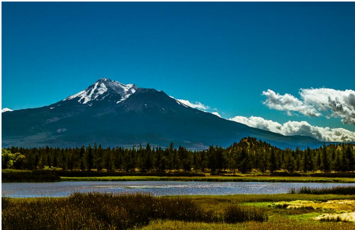
Snow-capped peak of Mt. Shasta towers over one of the many surrounding lakes.

Its name may be difficult to pronounce, but this Northern California County makes it easy to capture the American West!