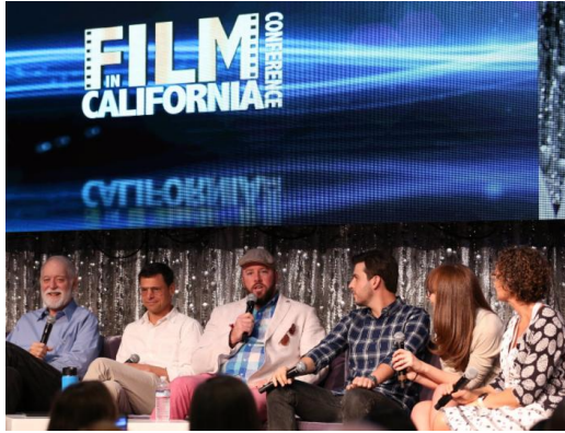
"This is Us" panel