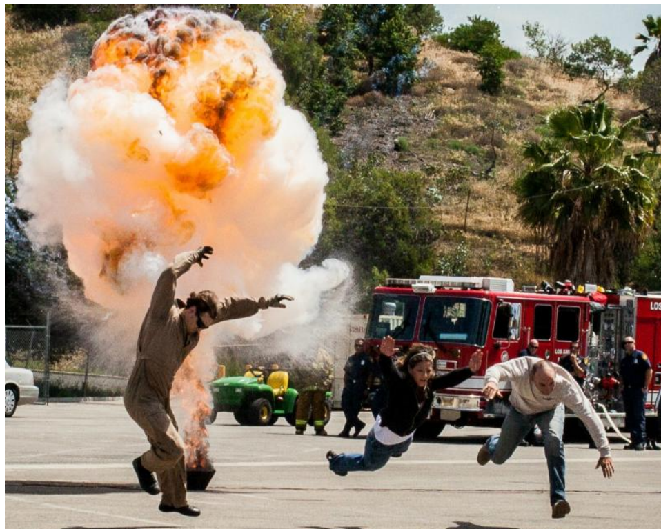
Explosive! Stunt performers demonstrate a pyrotechnic explosion.

On April 21, Deputy State Fire Marshal Ramiro Rodriguez certified 72 safety officers who completed the Motion Picture/Television Fire Safety Training Course held in Los Angeles.