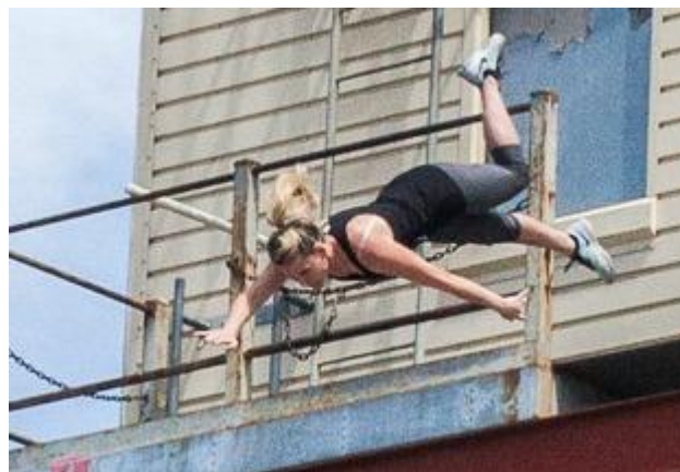
Don't try this at home.

Launched more than two decades ago, it remains the only course of its kind in the nation - which explains why it attracts so many fire safety experts from other states.