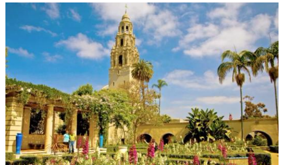
The Spanish Colonial-style California Building is home to the San Diego Museum of Man.

The Park has long set the scene for feature films ranging from "Citizen Kane" and "Traffic" to "Almost Famous" and "Anchorman: The Legend of Ron Burgundy," as well as the TV series, "Veronica Mars" and numerous commercial and print campaigns.