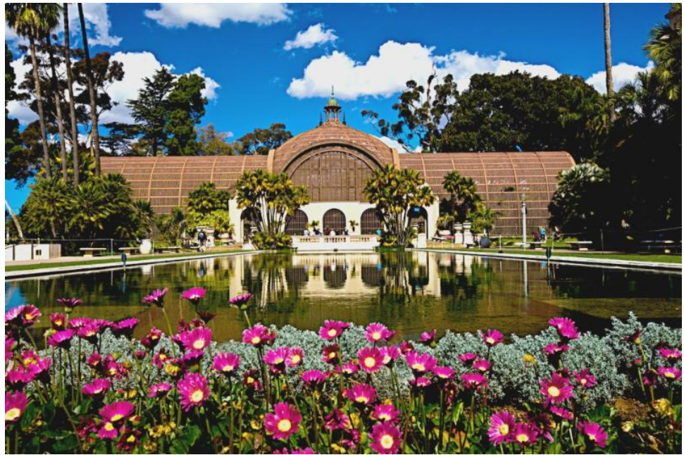
Built for the 1915 Panama-California Exposition, the historic Botanical Building and its adjacent Lily Pond are home to a fascinating collection of tropical plants.

This urban oasis provides the ideal tapestry to bring stories of any period to life.