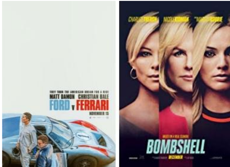
Ford v. Ferrari (11/15/19) and Bombshell (12/20/19)