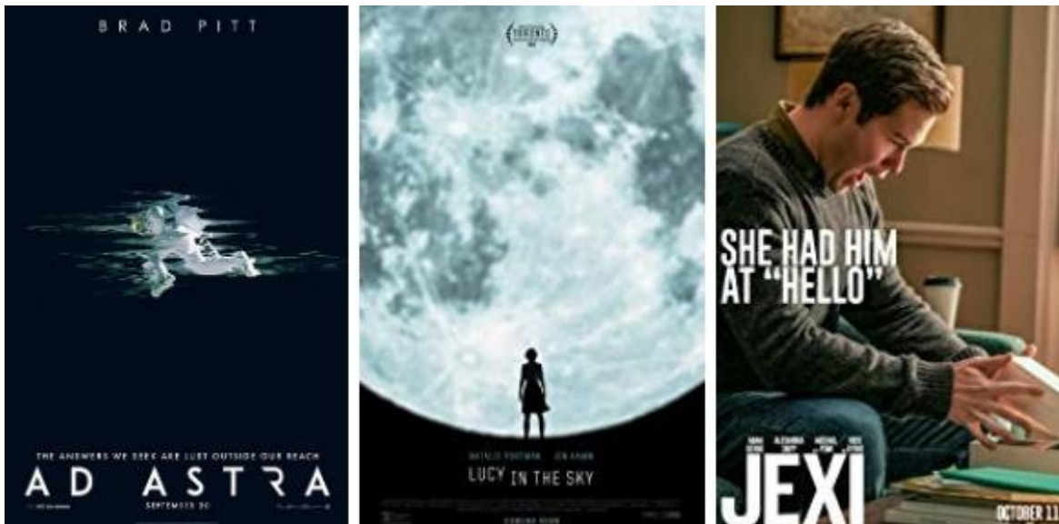
Ad Astra (9/20/19), Lucy in the Sky (10/4/19) and Jexi (10/11/19)